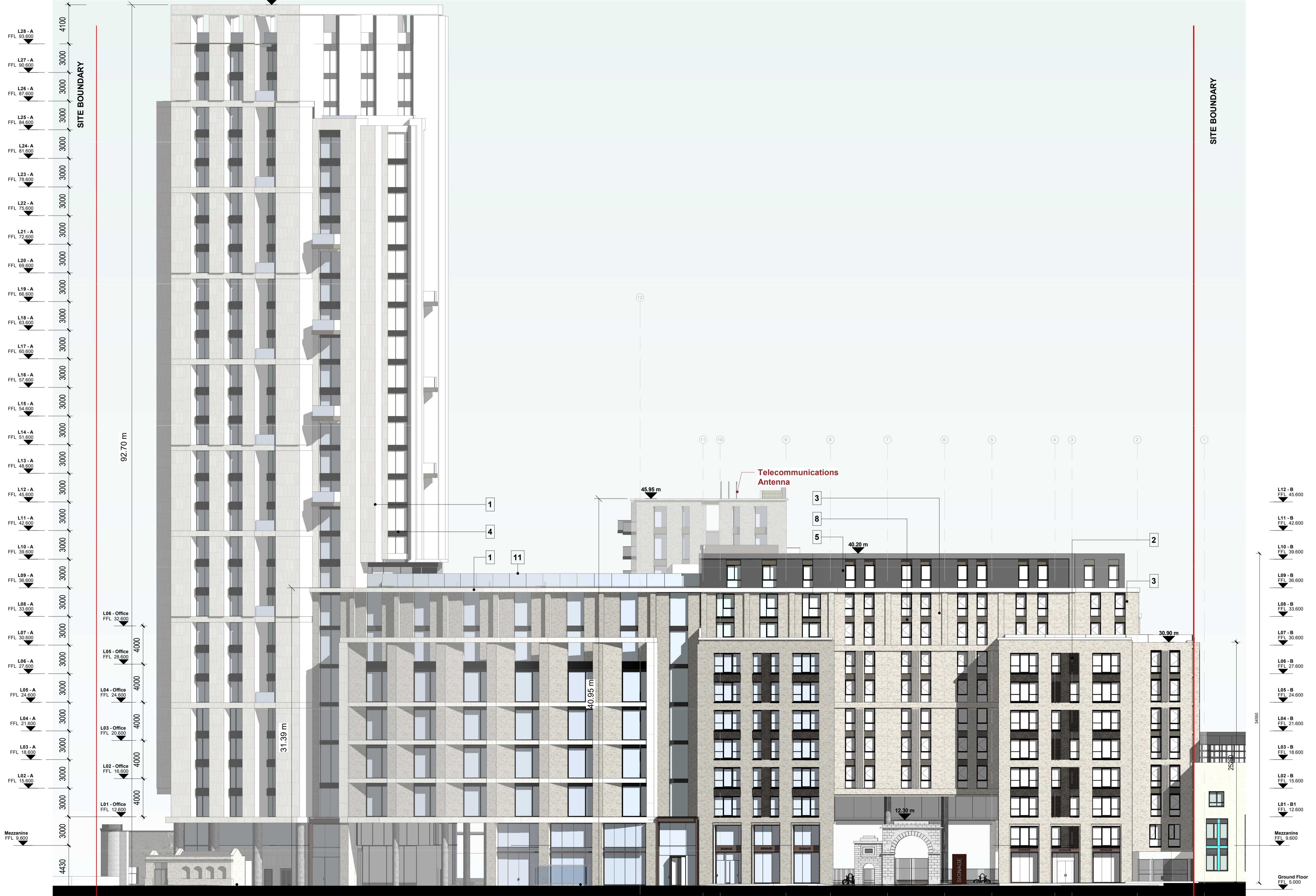
NORTH ELEVATION 1 : 200